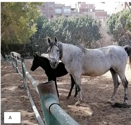
Plate 3. Exploratory behavior of young foals to it's environment