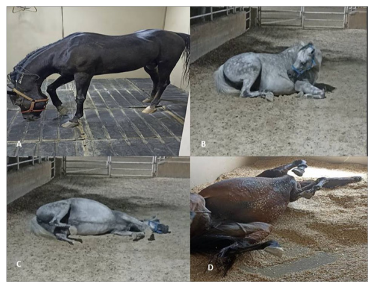
Fig. 2. A) Arabian horse show Pawing (EAAPS 3) as a sign of spasmodic colic. B) Arabian mare showed sternal recumbency with attempting to lie down with flank staring (EAAPS 4) as a sign of severe flatulent colic. C) Arabian mare showed lateral recumbency (EAAPS 4) with severe abdominal distention as a sign of severe flatulent colic. D) Arabian mare suffered from severe flatulent colic showed rolling on the ground. (*) EAAPS = Equine acute abdominal pain scale.