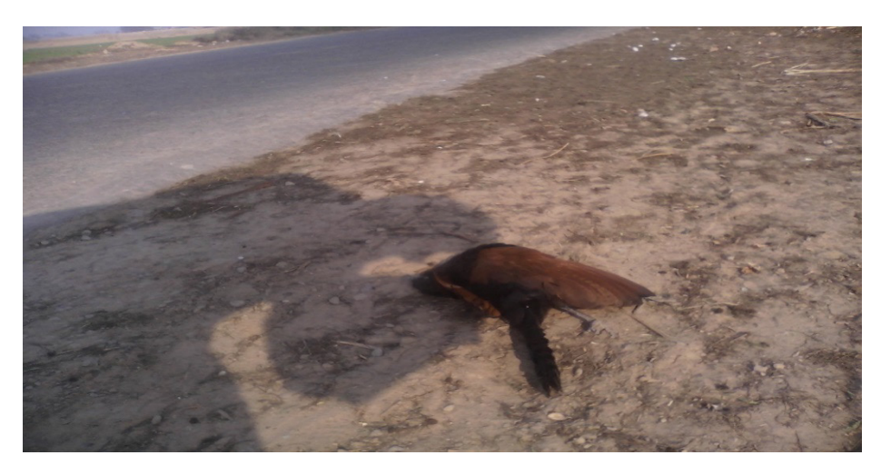
Fig. 5. Showing Mortality of Bird