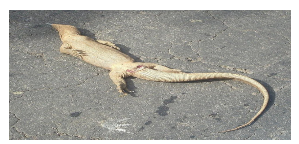
Fig. 6. Showing Mortality of Reptile