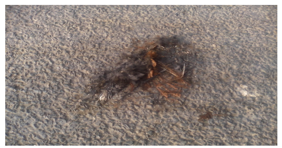
Fig. 4. Showing Mortality of Bird