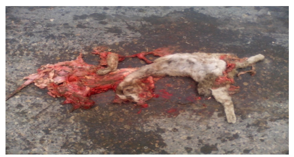
Fig. 3. Showing Mortality of Mammal