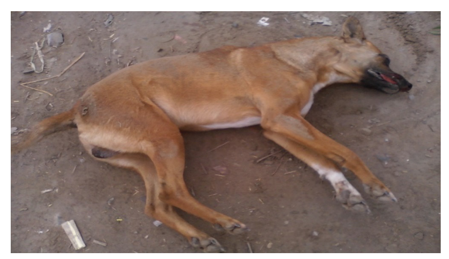
Fig. 2. Showing Mortality of Mammal