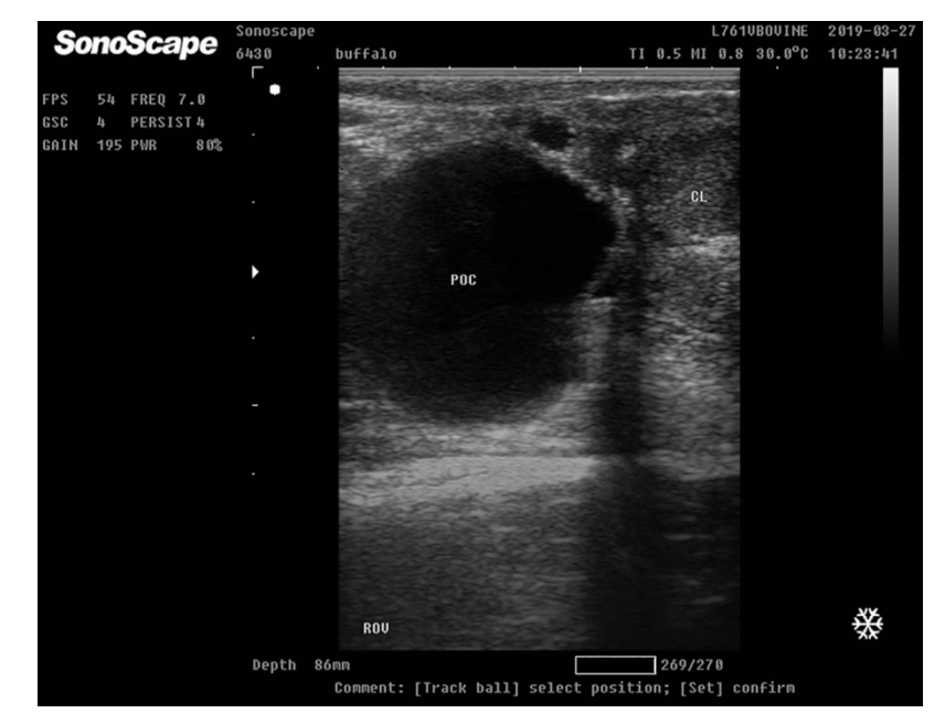
Fig. 1. Representative ultrasonogram of paraovarian cyst in buffalo heifer nearby the ovary that presented corpus luteum. Paraovarian cyst (POC) appeared as a large translucent anechoic cavity. The corpus luteum (CL) showed a varying degree of heterogenicity.

and pregnancy) is shown in (Table 2). Analysis of the obtained data revealed, as expected, that the paraovarian cysts size, follicular number (P= 0.845) and corpus luteum size (P= 0.161) were not statistically varied, although dominant follicle size tended to be significantly (P= 0.069) differed between groups.